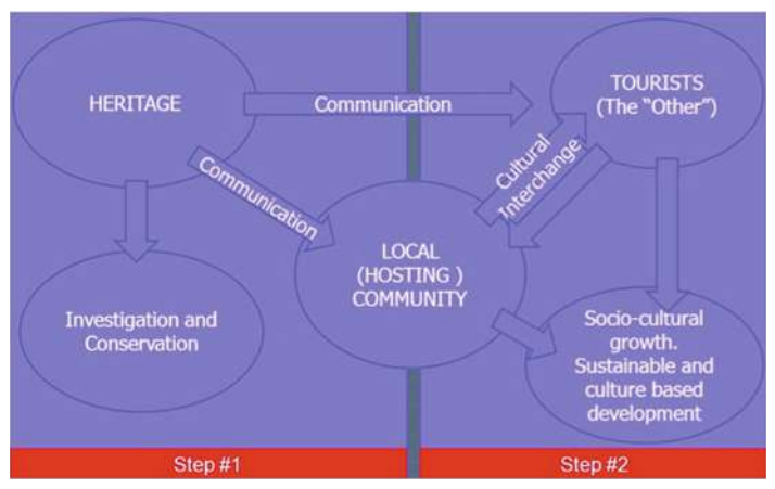
Fig. 2: Paideia Approach. Graphical representation of the concept

This idea is moreover in accordance with the effort of several supranational entities which are committed to create recommendations for destinations managers and professionals of the tourism sector and heritage management, based on the idea that tourism should represent a vehicle