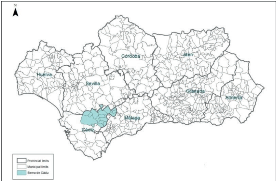
Figure 1: Location of Sierra de Cádiz in the region of Andalusia, Spain

In order to develop this research, three municipalities were selected in the district according to the following criteria: demographic characteristics, number of accommodations, local tourism policy, or importance in the tourism image of the area, mainly (i) Grazalema, (ii) Olvera, and (iii) Setenil de las Bodegas. The three municipalities account for almost 20 percent of assets catalogued in the district for the highest level of protection by the national and regional administrations responsible for cultural heritage. These are also some of the most representative municipalities in terms of tourism capacity in the district, and together they represent over a quarter of the total available spaces of accommodation, with almost 11 percent of total tourist apartments in the entire province according to the Regional