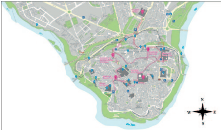
Figure 3: Map of El Greco Spaces.

number of travelers in Toledo in 2014 increased by 20.69%, compared to 2013, increasing from 491,362 to 593,028; and overnight stays in Toledo increased by 21.6%, from 738,586 to 898,547.