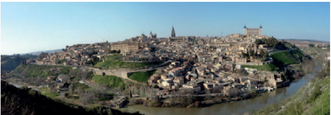
Figure 1: Toledo, cultural tourist destination.

The city of Toledo, with its medieval old quarter and unique landscapes, has been a protected site since the early 1940s, when it was designated as a National Historic-Artistic Site. With more than 120 Sites of Cultural Interest (Ministry of Education, Culture and Sport, 2015), it was declared a World Heritage Site by UNESCO in November 1986. For many sites inscription of the World Heritage List acts as a promotional device and a factor that increases the number of tourists (Bourdeau, Gravari-Barbas & Robinson, 2015). The cities or historical sites declared World Heritage constitute a crucial added value to ensure the existence of a rich historical and cultural heritage that meets the demands of cultural tourists (Cordente et al., 2011). Toledo is clearly a cultural tourist destination (Figure 1), 2 in which the appeal of its heritage resources (Troitiño, 2005) do not require an active policy of promotion or creativity and innovation to renew its supply. Although we shall observe that there are a number of issues arising from tourism that do require intervention, Toledo needs only to offer its resources in order to be considered a significant cultural tourism destination (Garcia, 2007).