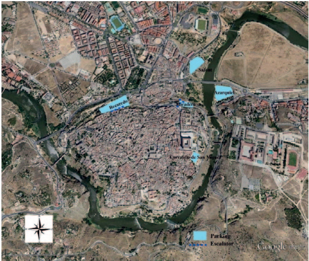
Figure 5: Main car parks and escalators in the center of Toledo.