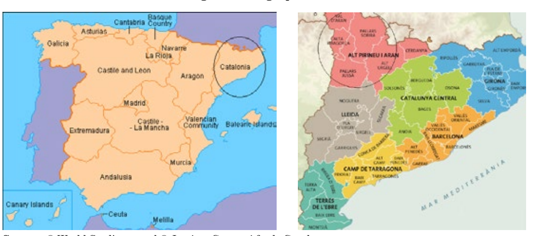
Figure 1: Geographic area

Catalan¹ hinterland economy is mostly based on its tourism industry (Miró & Alsina, 2013) —especially since 2008, when the international crisis arose. In this context, this sector has become a socioeconomic driver for the development of the hinterland regions that are located in the northern Lleida area, such as Pallars Sobirà, Pallars Jussà, Alt Urgell and the Aran Valley (Miró, 2014), and Berguedà in the north of the Province of Barcelona.